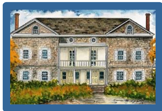
"The Mount Vernon Hotel" Watercolor by Christine Y. Rother

There are chapters across the United States, as well as in London, Paris, and Rome.